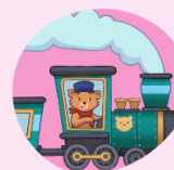
Down at the Station