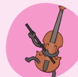
Hey, Diddle, Diddle