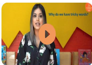
How we teach tricky words