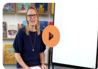
How we teach blending

You will find handy videos to watch, showing how we deliver phonics sessions, focus on blending and how we teach tricky words.